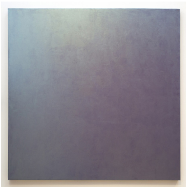
Year of the Dragon , 2014, acrylic on canvas, 66 x 66 inches

A number of these works are on view in the exhibition: triangular, cruciform, and unnamable shapes that show the artist working at the height of innovation.