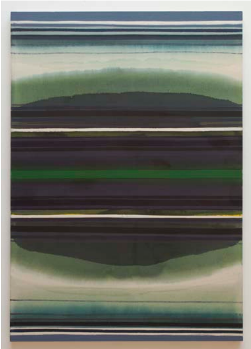
Coast Stripe , 1961, oil on canvas, 74.5 x 52.5 inches

Opening Reception: Thursday, September 8, 5:30 pm to 7:00 pm