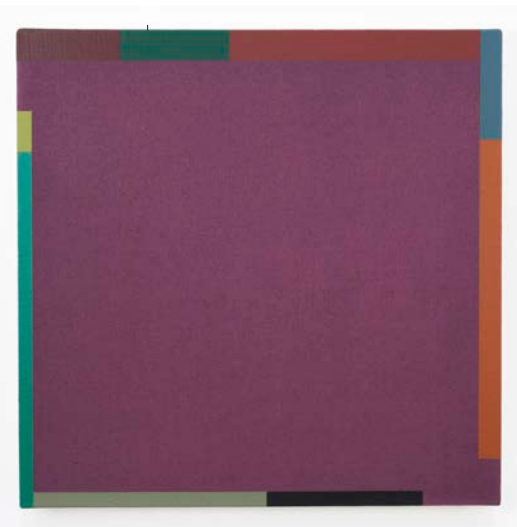
Amigo #5 , 1976, acrylic on canvas, 79 x 79 inches

Haines Gallery is pleased to present Now & Then: The Work of David Simpson , a solo exhibition spanning over five decades of artwork by one of the San Francisco Bay Area's most significant painters. This retrospective look at Simpson's extraordinary career coincides with the publication of David Simpson: Works, 1965–2015 , a new, large-scale monograph from Radius Books documenting the artist's entire oeuvre.