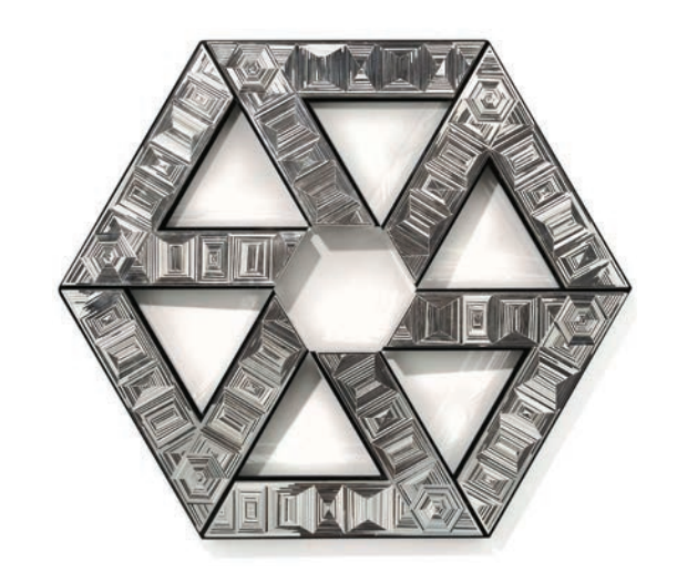
First Family - Hexagon, 2010 Mirror and plaster on acrylic and wood 41 x 47 x 5 inches