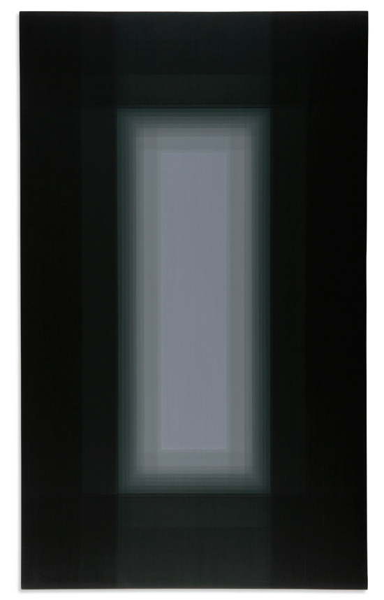
Untitled (dark green / grey), 2011, Acrylic on panel, Panel: 20 x 12 inches

Bay Area-based Patsy Krebs exhibits new paintings that continue her long-term consideration of the rectangular form, building upon works shown in the 2008 exhibition at Haines Gallery, Hibernal Dreams . Krebs explains, "abstract visual language has remained my primary artistic interest for its enduring capacity to shape a symbolic equivalent to the otherwise ineffable in the human experience."