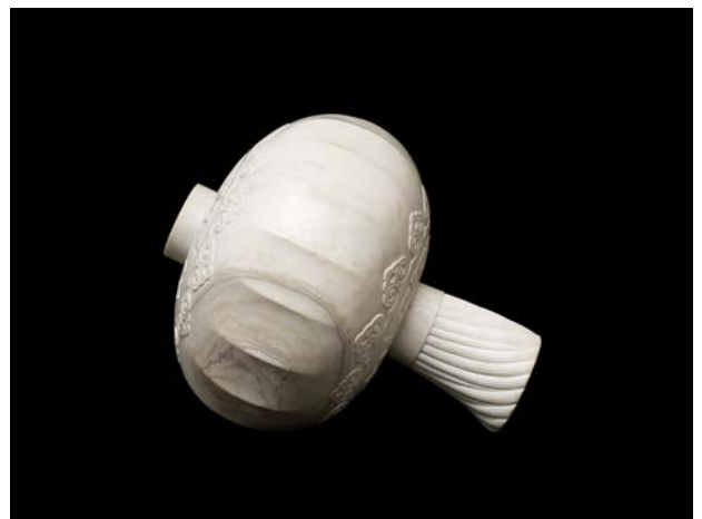
Ai Weiwei, Lantern , 2014 Marble, 23 x 20 x 20 inches Edition of 16 + 4 AP