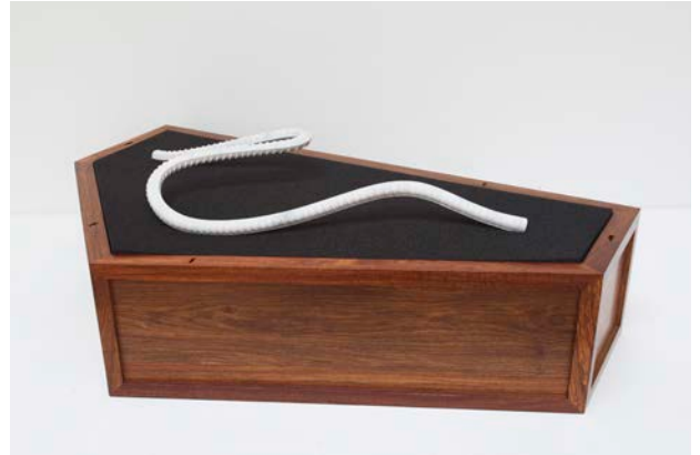
Ai Weiwei, Marble Rebar , 2014 Marble and wood box, 15.5 x 46 x 26 inches overall Edition of 10 + 2 AP

Persecuted for his ongoing efforts to shed light on such corruption and human rights abuses, Ai was brutally beaten by police and ultimately disappeared—taken into extrajudicial custody by the Chinese authorities for 81 days, leaving the world and his loved ones to wonder about his whereabouts and safety. Following massive public outcry for Ai's release, in the summer of 2011 the artist found himself free from imprisonment, but stripped of his passport and the subject of constant surveillance. The Lantern (2014) is a testament to Ai's mocking response to the video cameras that once surrounded his Beijing studio, which he defiantly festooned with red paper lanterns, traditionally associated with festivals. The exquisitely carved form appears to blow in the wind despite its marble girth, as if free from the oppression of gravity. Nearby, the Ceiling Lamp with Stars (2014) represents a light fixture common in Communist China during the 1950s and 60s. Adorned with five-pointed stars, the marble sculpture is a symbol of the Communist Party, and speaks to an era of Soviet-inspired modernity—a bygone utopia whose legacy is still strongly felt today.