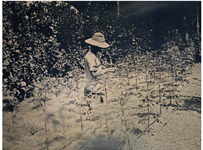
Cannabis Farm, Nevada City, CA #1, 2019 Daguerreotype, unique (in camera exposure) 6 x 8 inches

Established during the California Gold Rush in 1849, Nevada City was once the most important mining town in the state. In the 170 years since, it has slowly evolved with each shift in local industry and population demographics. Following the Nisenan Native Americans, who initially settled the land, Nevada City has been home to successive waves of miners, loggers, and Chinese pioneers who informed its early development; later, it was reimagined as a return to nature by the Back-to-the Landers, who were drawn to its location at the foothills of the Sierra Nevadas in the 1960s and 1970s. Today, Nevada City sees its character changing once again with the tourist industry, the Green Rush from the now-legal cannabis industry, and increasing presence of those working remotely for Bay Area tech companies. Danh is the first artist from Haines Gallery to utilize the Nevada City residency in some time. A forthcoming project from photographer John Chiara, the result of a multi-part stay, will debut in 2020.