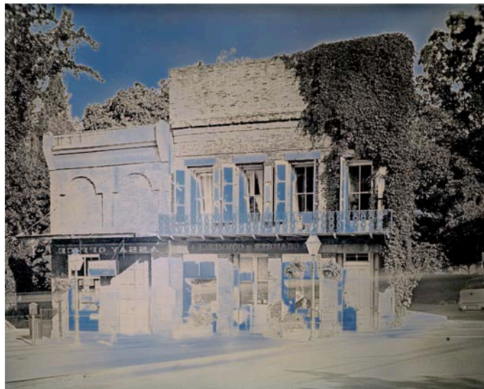
Nevada City Chamber of Commerce, Nevada City, CA, 2019 Daguerreotype, unique (in camera exposure) 8 x 10 inches