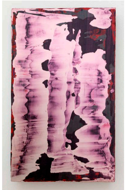
Palmyra 3 , 2017 Acrylic on panel 18.5 x 11 inches

Floating Ashes ). Some make ironic commentary about power ( Victory! and Commander in Chief ). Yet others address specific places and events, such as Mosul and Palmyra , which refer to the systematic destruction of ancient sites and monuments by ISIS in Iraq and Syria respectively.