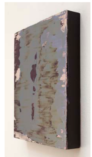
Side view of Trajectory