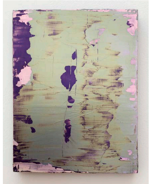
Trajectory , 2017 Acrylic on panel 13 x 10 inches

Simpson’s outrage is reflected in the titles chosen for these newest works—typically enigmatic and whimsical, here they take a harsher turn. Some make damning statements about a hawkish approach to foreign policy ( Dogs of War ), the narratives (and agencies) used to justify conflict ( Homeland Security ), and the horrors of war ( Mistakes Were Made and