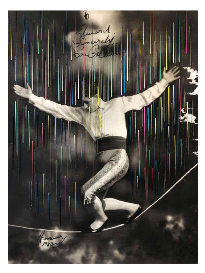
Galliano, 2018 Embroidery on found photograph 19 x 15 inches

Using thin strips of brass and steel, gaffer tape, and colored paper, Anzeri extends the action of each circus performer beyond the confines of the image. His careful selection of material, cropping, and composition draw us further into the world of the photographs. Anzeri's circus scenes are as whimsical as they are enigmatic, filled with uncanny figures and mysterious emanations.